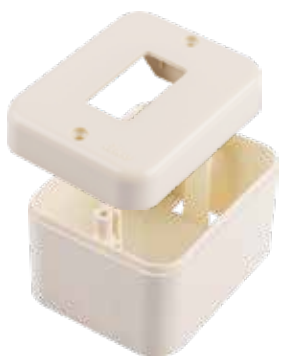
1 Gang surface mounting box