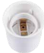
E27 lamp holder - Body in urea formaldehyde (4A)