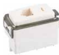
RJ 11 telephone socket 4 terminals