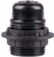
E27 lamp holder - Body in black phenolic (4A)