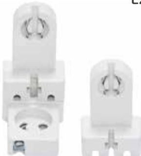
Set of two lampholders for fluorescent G13 lamps with one starterholders (2A)