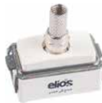
Satellite coaxial socket outlet with wire connector