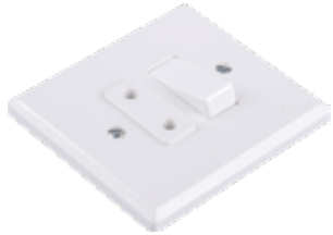
Single pole one-way switch & one (2x10A) socket-outlet (6A) for the switch (10A) for the socket