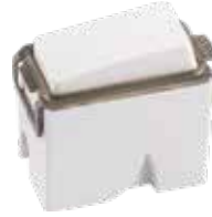
Single pole two-way switch (16A)