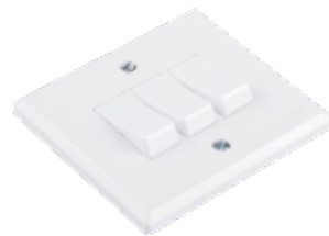
Three single pole one-way switches (6A)