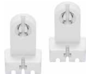
Set of two lampholders for fluorescent G13 lamps (2A)