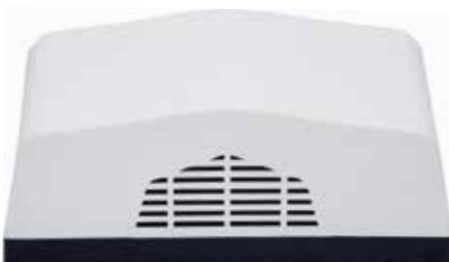
Ding dong - doorbell 230V ~ 50Hz