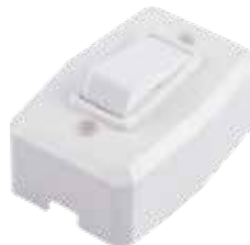
Single pole bell push button (2A)