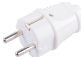
2x16A schuko plug with side earthing Body in polycarbonate (16A)