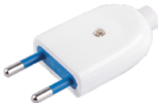
2x10A plug Body in polycarbonate (10A)