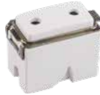
2x16A socket-outlet (16A)