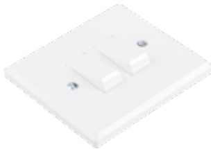
Two single pole one-way switch (6A)