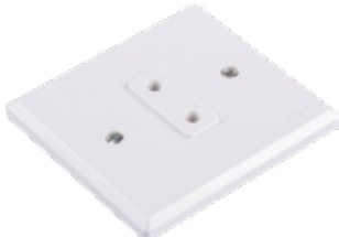
2x16A socket - outlet (16A)