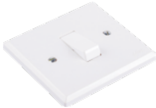
Single pole one-way switch (6A)