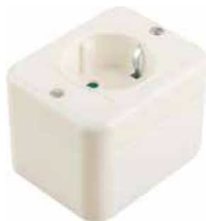
Schuko surface mounting box