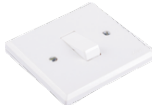
Single pole bell push button (2A)