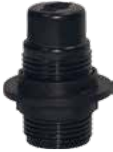
E14 "mignon" lamp holder with safety lock (4A)