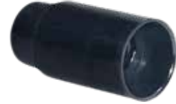
E14 "mignon" lamp holder - Body in black phenolic (4A)