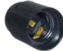
E27 lamp holder - Body in black phenolic (4A)