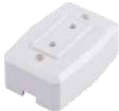
2x16A socket-outlet (16A)