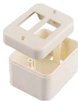
2 Gang surface mounting box