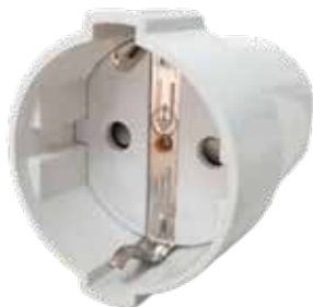
2x16A schuko socket-outlet Body in polycarbonate (16A)