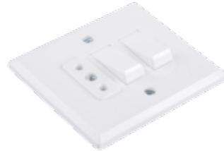
Two single pole one-way switches & one (2x10A) socket-outlet (6A) for the switches (10A) for the socket