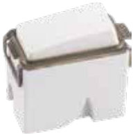
Single pole bell push button (2A)