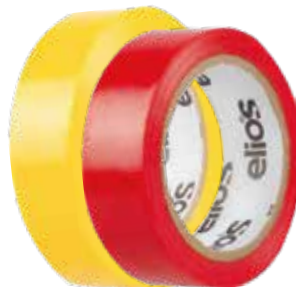
P.V.C. insulating tape Available lengths: 10 meters & 20 yards Available in different colors