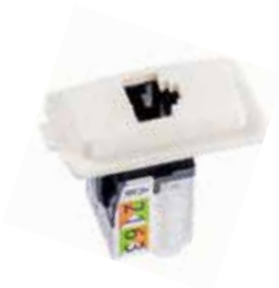
RJ 45 Socket Cat. 6e