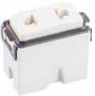
2x16A Euro-American standard socket (16A)